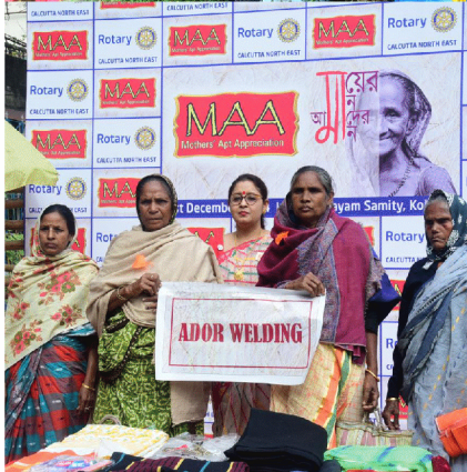
“Celebrating mothers with Rotary”